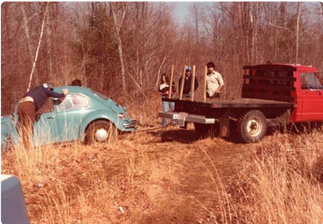
Always an adventure